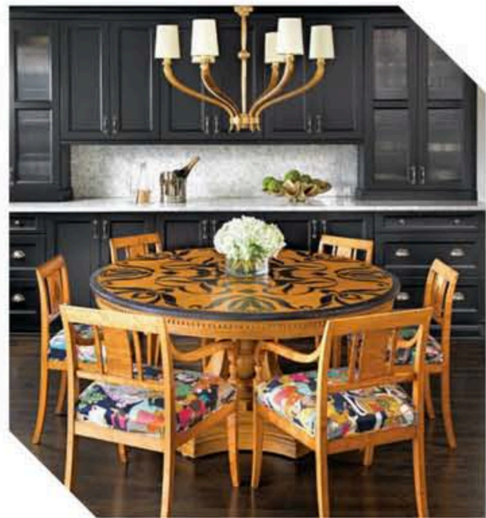
ROUND TABLE After many unsuccessful attempts at finding the right dining room table for the space, Vaile and O'Hara had one customized with a hand-painted design that subtly references the Asian influence of the colorful upholstery on the chairs.

The designers focused on black and white, then layered in pops of color and exotic accents that hinted at Ana's Latin American roots. Their inspirational starting point was a Mongolian print that covers a bench in the foyer; it was bright and worldly, and it reminded them of a beautiful Hermès scarf.