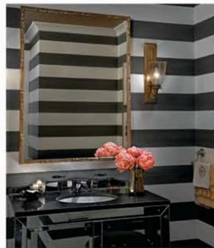
RIGHT STRIPE From top: The airy bedroom comes alive with bold pops of color; wallpaper that runs horizontally and gilded accents create a pretty retreat in the powder room.

A space that had previously been a children's playroom is now Patrick's "man lounge," complete with a custom wooden bar; a clubby chestnut leather banquette; multiple TV screens for game-watching; and walls filled with vintage football photos celebrating his alma mater, Notre Dame. In the living room, a black-and-white wool-and-silk rug features a striking geometric pattern designed by Vaile, O'Hara and their clients specifically for the project. Black wainscoting was added to play up the drama of a 15-foot-long hallway, and piles of pillows in contrasting prints have turned the home's low rectangular radiators into inviting window seats.